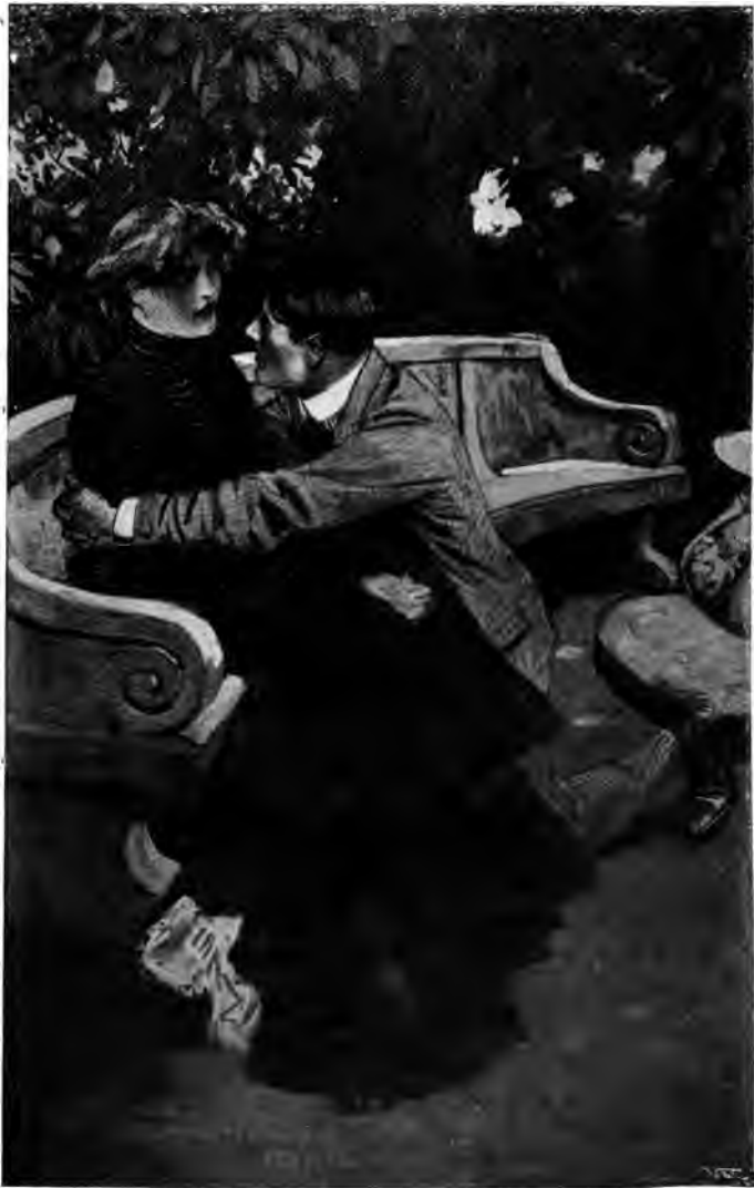
"His head came up in a flash, and his arms went round her!" The Garden of Lies [Page